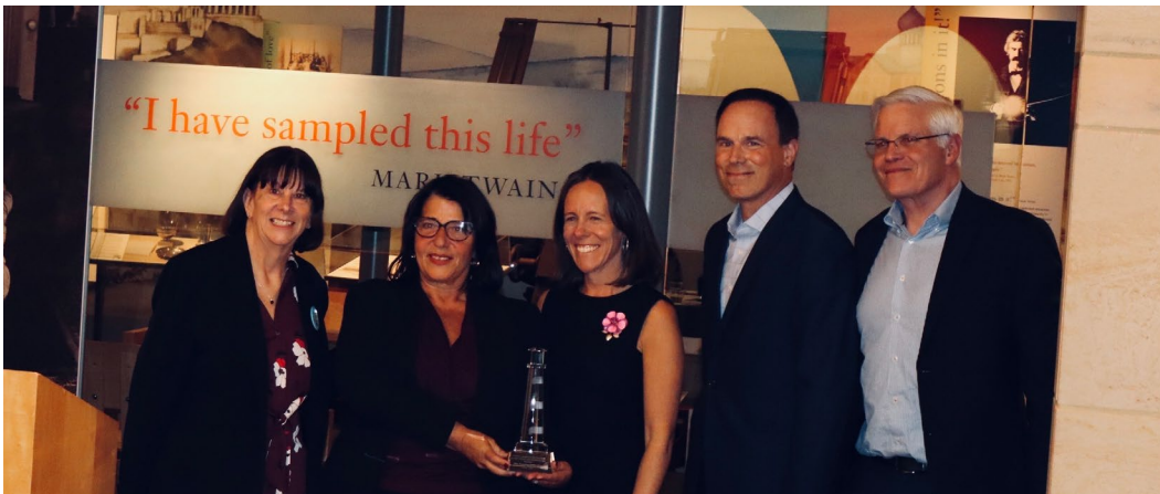
Staff from the Centers for Housing Opportunity accept a Connecticut Foundation for Open Government Mitchell W. Pearlman Freedom of Information Award, October 2025.

From helping tenants fight unfair rent hikes, to supporting grassroots, pro-housing groups, and drawing attention to the lack of representation on local land use boards, in 2025 we focused on helping residents actively participate in the processes that shape housing in their communities. Through these efforts, we helped keep residents in their homes, supported local groups in engaging on housing in their own communities, and earned a 2025 Pearlman Freedom of Information Award from the Connecticut Foundation for Open Government.