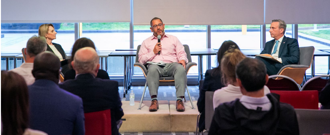
The Fairfield County Center for Housing Opportunity hosted a “Fairfield County Talks Housing” conversation with the CT General Assembly Majority Leaders in August 2025.